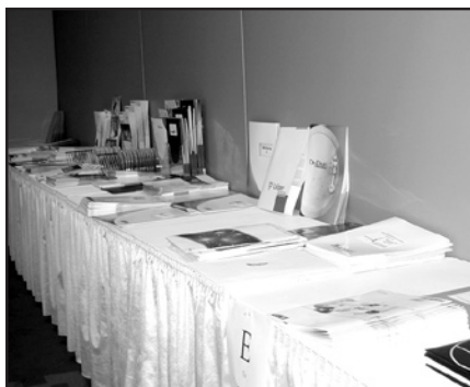
About 10 percent of the 1200 exhibitors prepared press kits for this trade show—2004 Pittsburgh Exhibition and Conference.

Because there are so many choices, the media kits that were bulky or hard to open were the ones that were more likely to be ignored or thrown away.